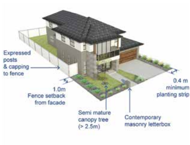
Diagram 06: Fencing