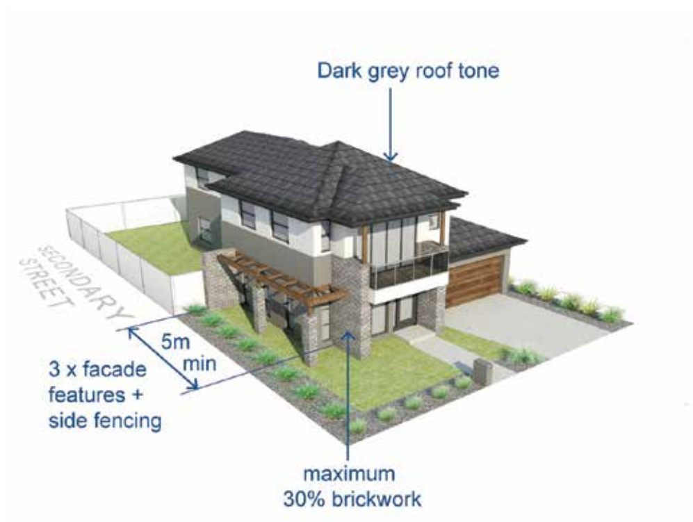
Diagram 04: Corner Lots