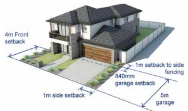
Diagram 02: Setbacks Corner Lot