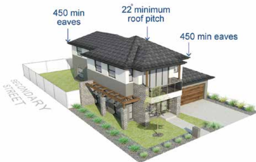
Diagram 03: Roof Design